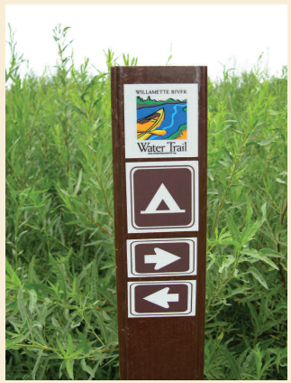
Look for the Water Trail sign.