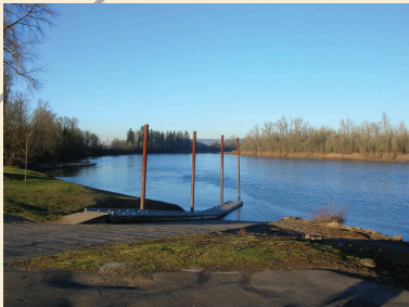
The landing at Independence Riverview Park

Navigation Hazard: Watch the bridge pilings at Independence, and wood pilings to the far left of the bridge.