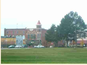
The historic architecture of the town of Independence can be seen from the river.